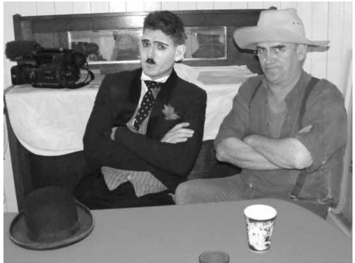
Charlie Chaplin and friend...