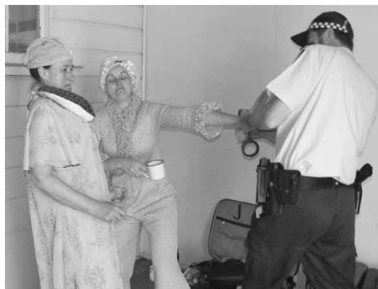
The local constabulary ensuring the Tea Tale Ladies did not steal the silver from the Red Rose Cafe